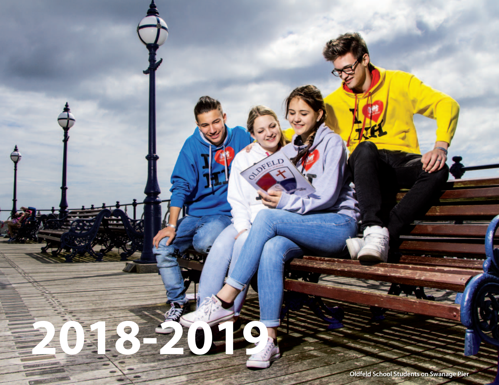
Oldfeld School Students on Swanage Pier