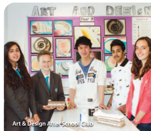
Art & Design After School Club