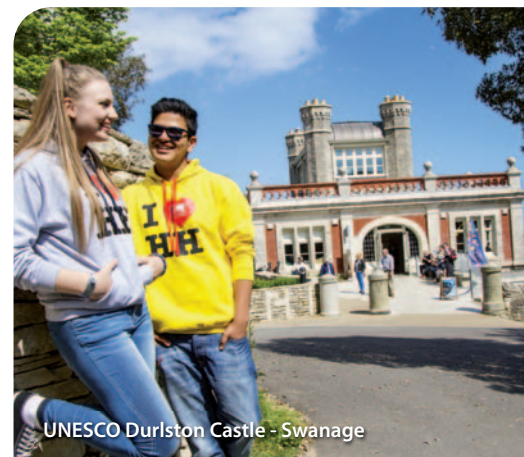
UNESCO Durlston Castle - Swanage