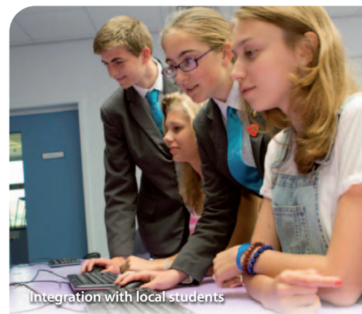
Integration with local students