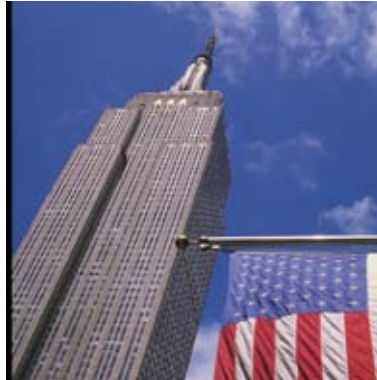
> Aspect New York in the Empire State Building