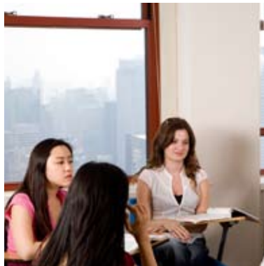
> Bright and spacious classrooms with amazing views of the city