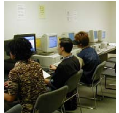
> Multimedia Center