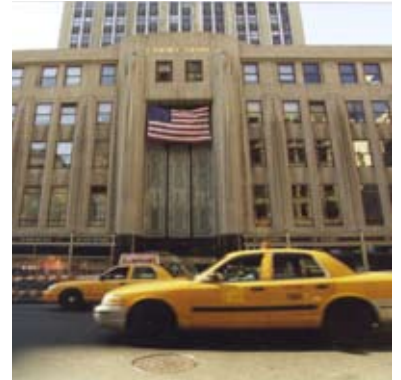
> The Empire State Building outside entrance