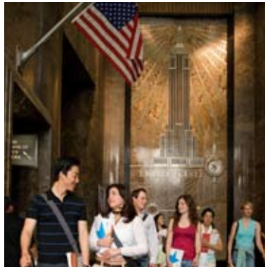
> Empire State Building, Reception