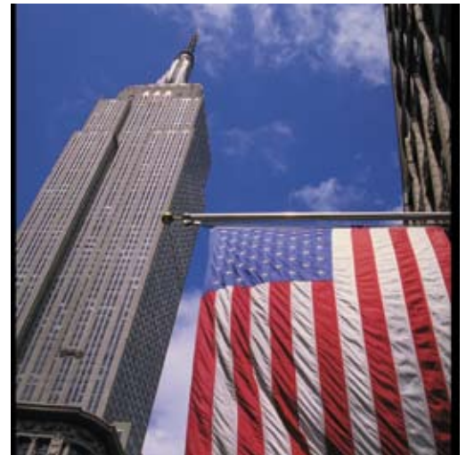
Aspect New York - The Empire State Building