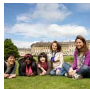
The Royal Crescent