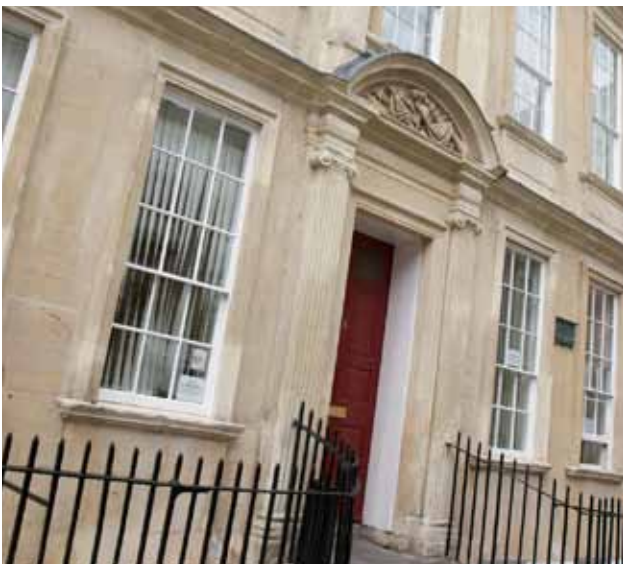
Kaplan International College Bath

Our Bath college is based in comfortable historical buildings right in the heart of the city, less than one minute's walk away from shops, cafés and restaurants. Pleasantly furnished classrooms are complemented by a computer centre and library, together with a common room where students can relax over a cup of tea or coffee. A tranquil courtyard garden offers a sanctuary in which to work or socialise outside.