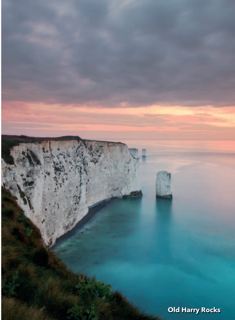
Old Harry Rocks