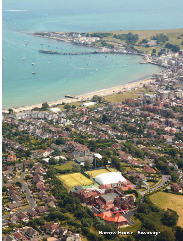
Harrow House - Swanage