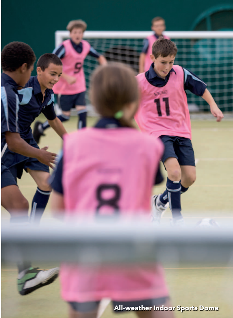
All-weather Indoor Sports Dome