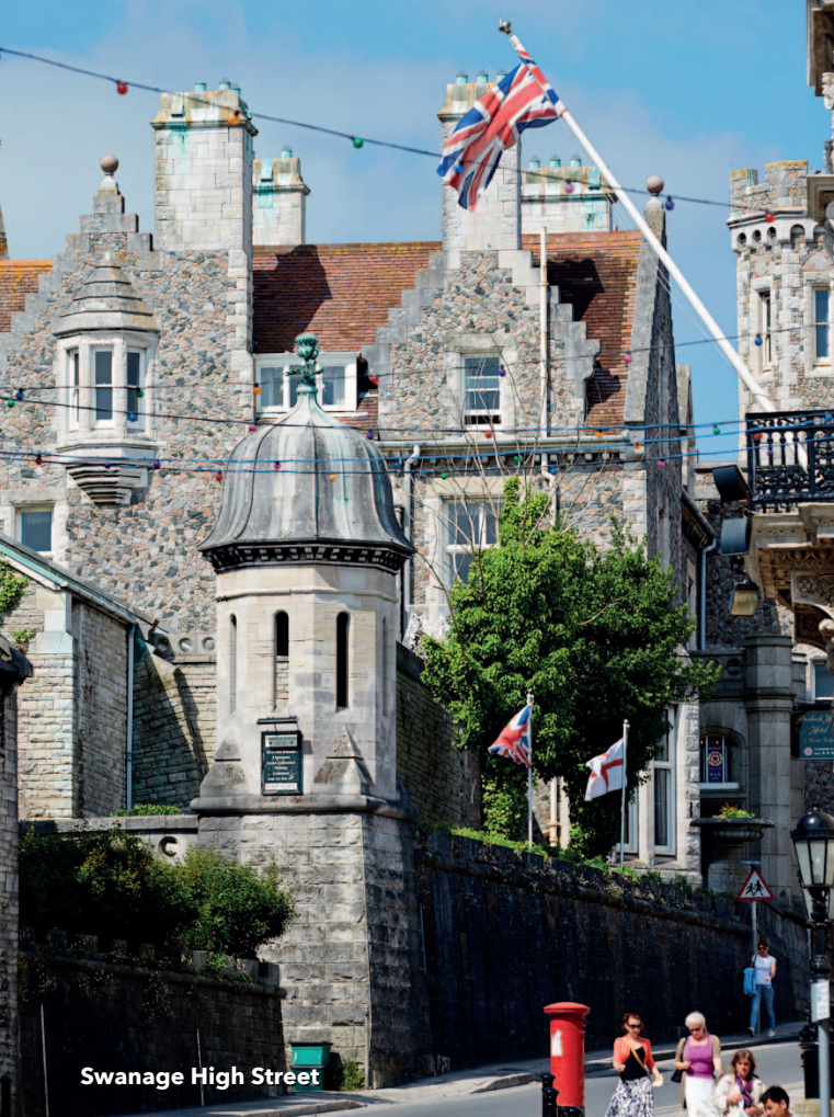
Swanage High Street