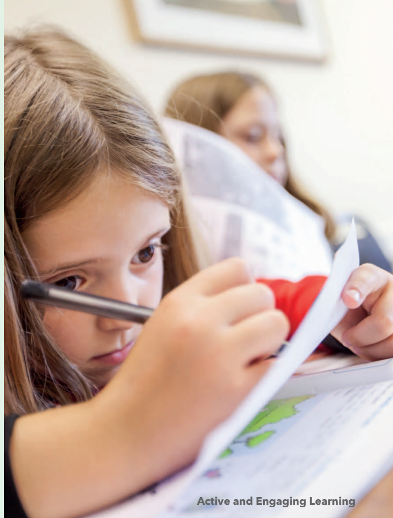
Active and Engaging Learning