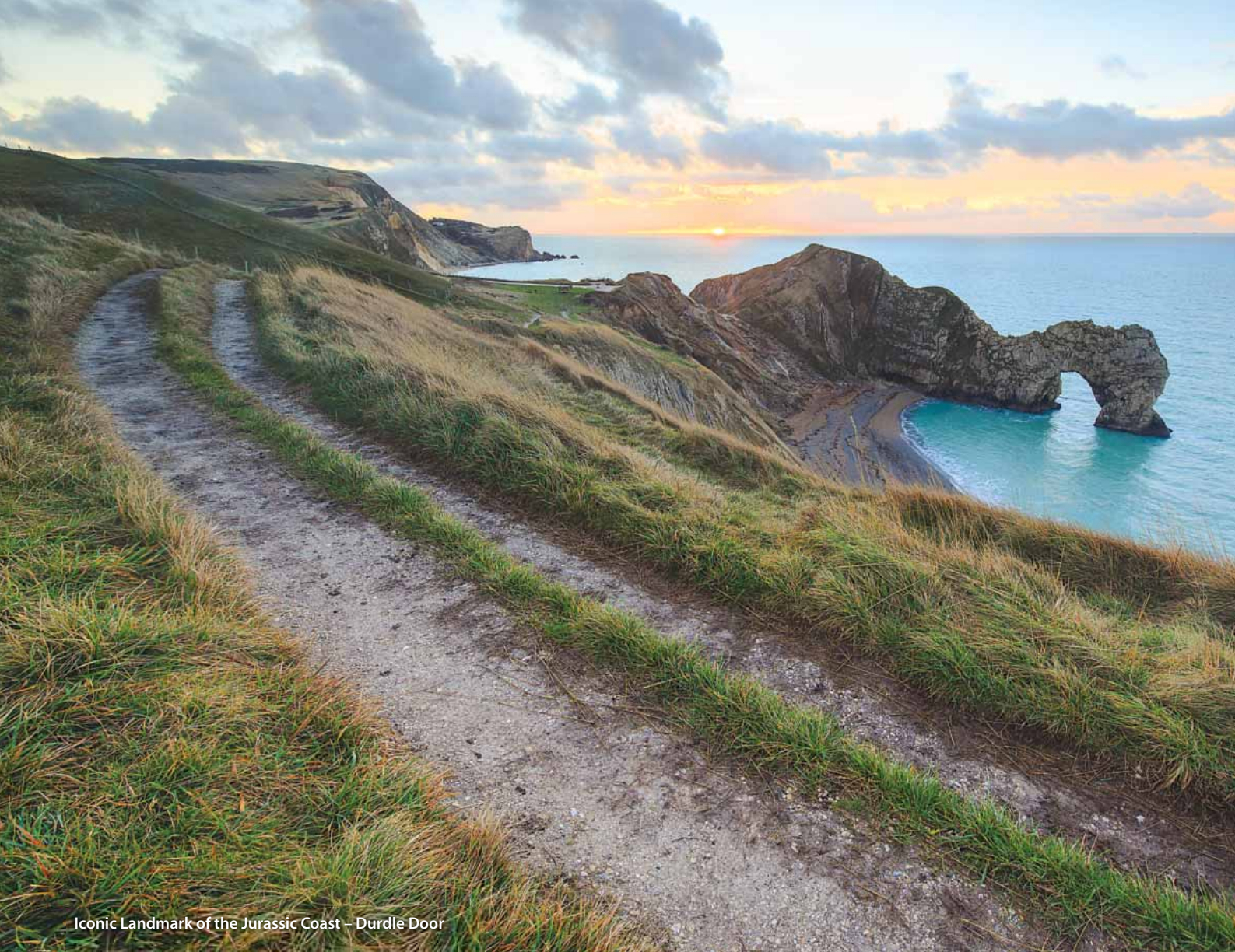
Iconic Landmark of the Jurassic Coast – Durdle Door