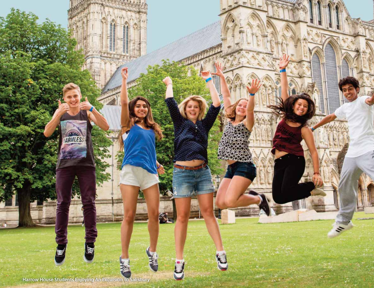
Harrow House Students Enjoying An Excursion to Salisbury