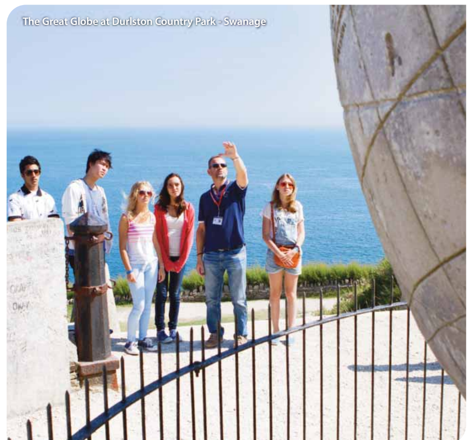
The Great Globe at Durlston Country Park - Swanage

The transfer time to Harrow House is approximately 2.5 hours from London Heathrow airport, 3 hours from Gatwick airport, 1.5 hours from Southampton and 1 hour from Bournemouth. Please see our website or supplementary manual for further details.