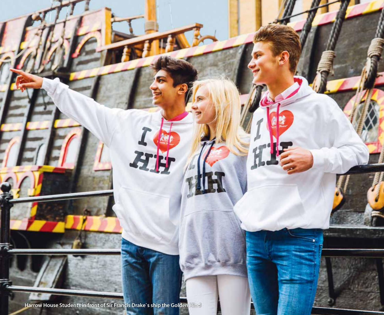
Harrow House Students in front of Sir Francis Drake's ship the Golden Hind