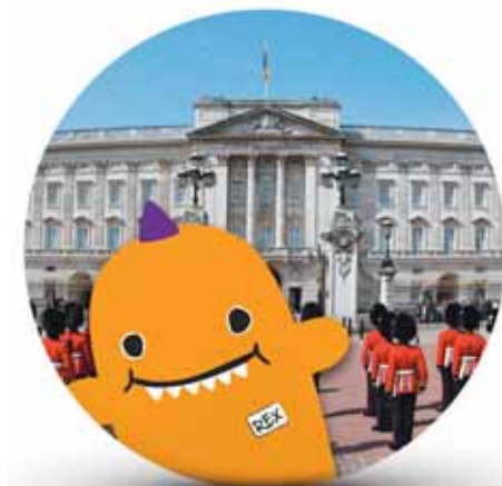
Rex the Harrow House mascot