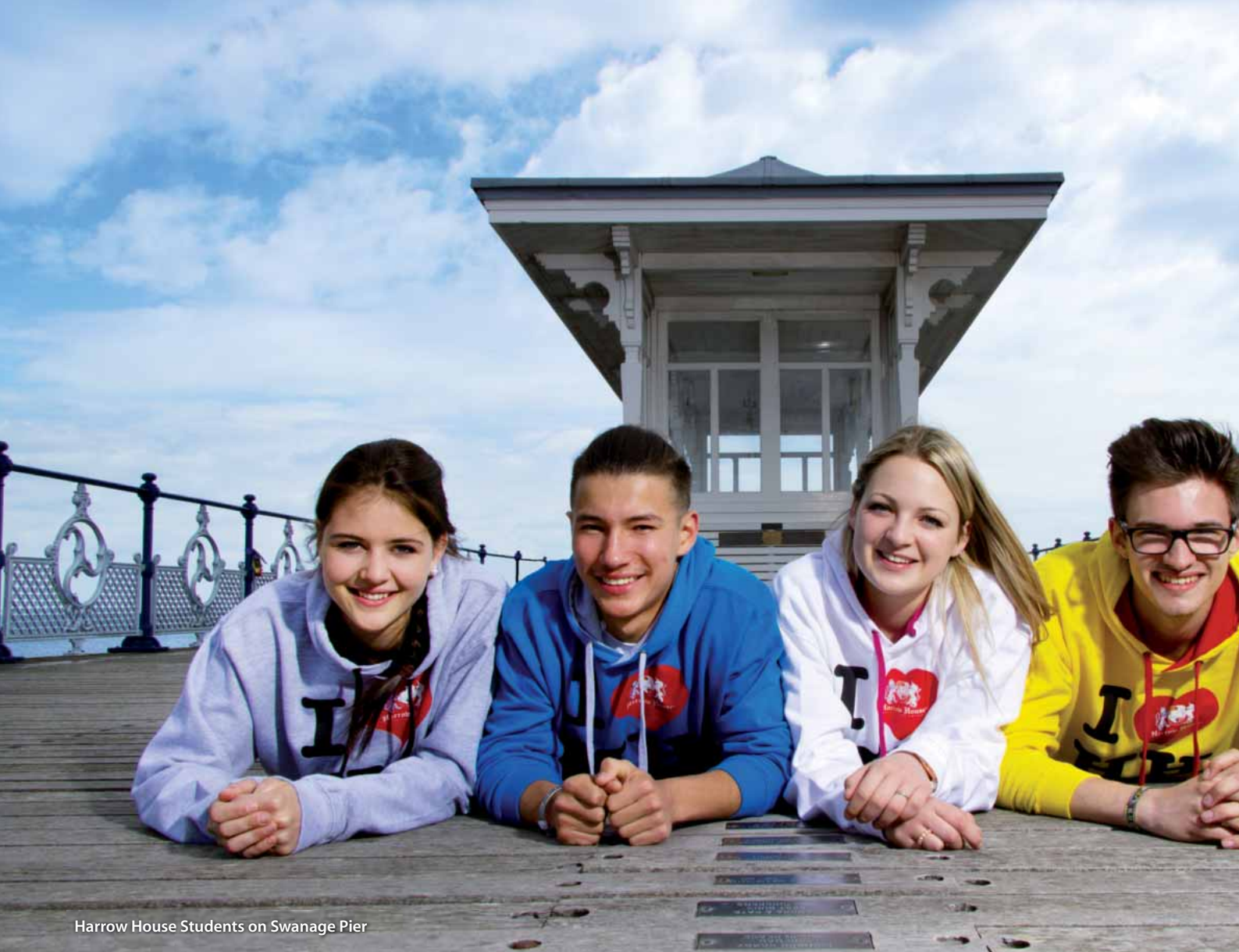
Harrow House Students on Swanage Pier