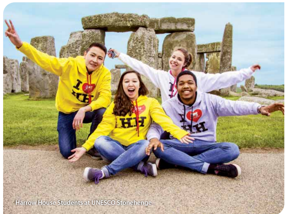
Harrow House Students at UNESCO Stonehenge