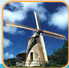
Morgan Lewis Sugar Mill