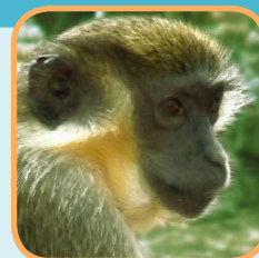
Barbados Green Monkey