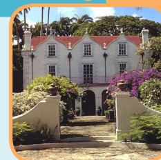
St. Nicholas Abbey