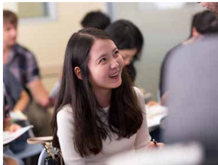
This list of programs is only a sample, a full list of academic programs can be found on the university website.