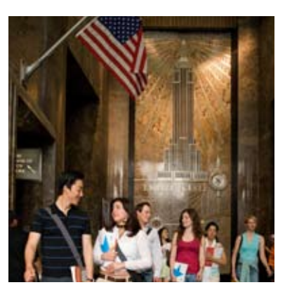
> Empire State Building, Reception