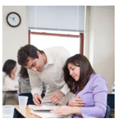
> Aspect Classroom