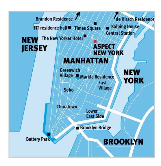
Aspect New York Empire State Building, 63rd floor 350 5th Avenue New York