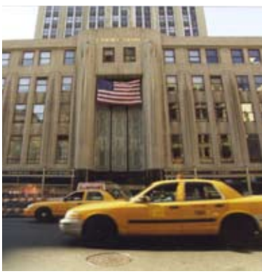
> The Empire State Building outside entrance