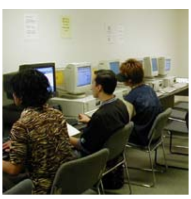
> Multimedia Center