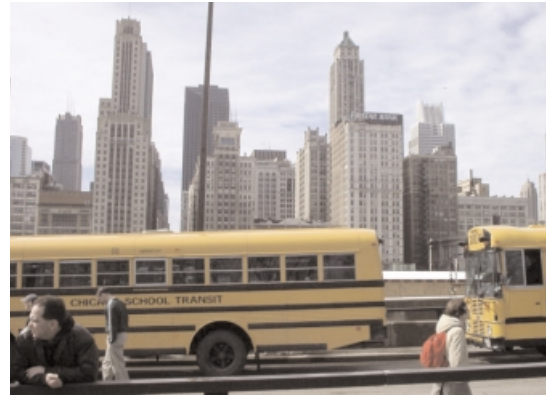
Chicago's stunning skyline!